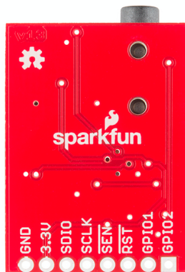
Underside of breakout board showing pin labels

For communication, the breakout board provides access to SDIO and SCLK for I 2 C communication. The RST pin is also broken out for ease of resetting the module.